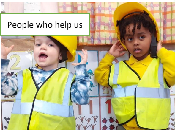
People who help us