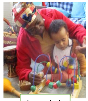
I can do it