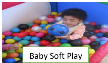
Baby Soft Play