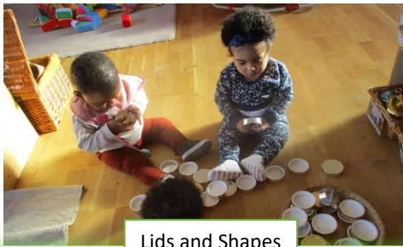
Lids and Shapes